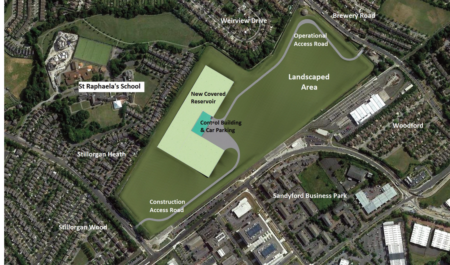
Proposed Covered Reservoir Layout

Irish Water has published a scoping report which sets out the issues to be considered in