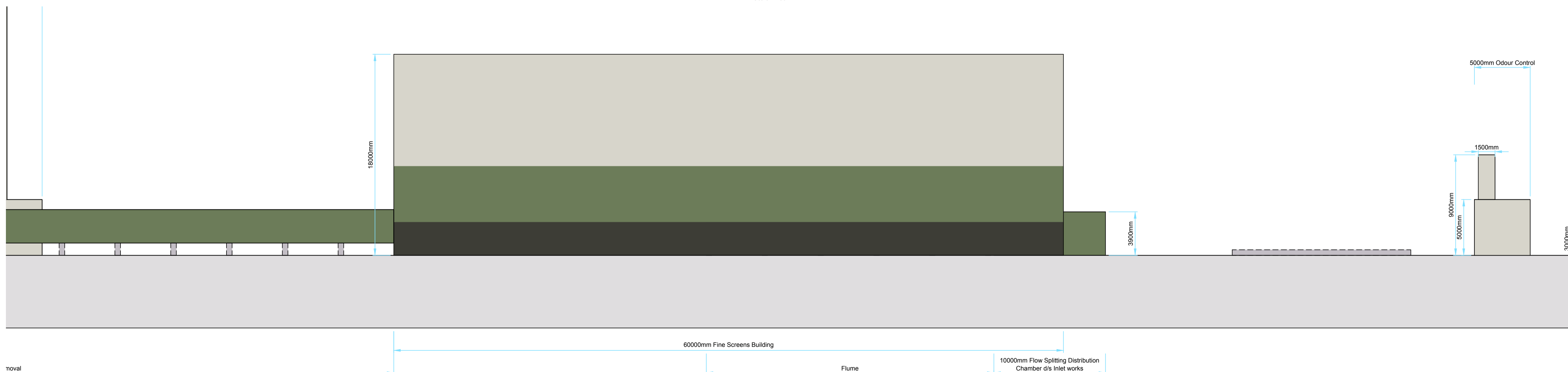
Sectional Elevation Looking North - Elevation 3 Scale 1:200