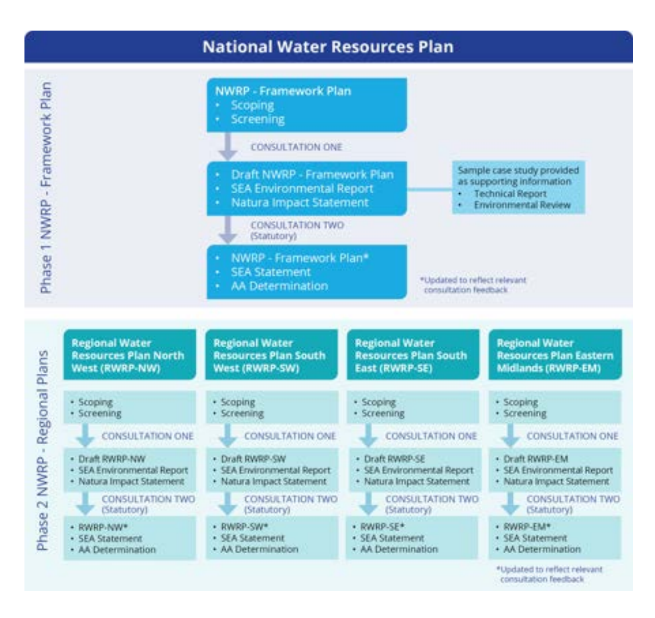
Figure 1.1 Components of the National Water Resources Plan

The Framework Plan and Consultation Two Report is available online at <a href="https://www.water.ie/projects/strategic-plans/national-water-resources/">https://www.water.ie/projects/strategic-plans/national-water-resources/</a>