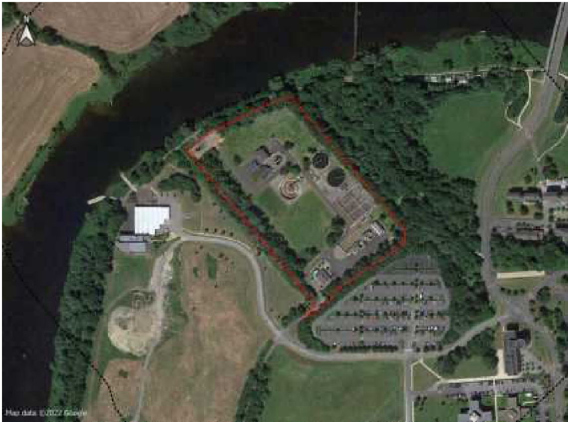
Figure 13-1: Site Location Plan

Castletroy WwTP is situated on the banks of the Lower River Shannon, approximately 3km north-east of Limerick City, adjacent to the University of Limerick campus. The site is bordered by the Lower River Shannon to the north, a vegetive buffer of trees and parkland to the east, and a University of Limerick car park and the rowing club facilities to the south and west, respectively (See Figure 13-1 below). The proposed works are within the site of the existing WwTP and as such, the character of the site is considered urban/developed.