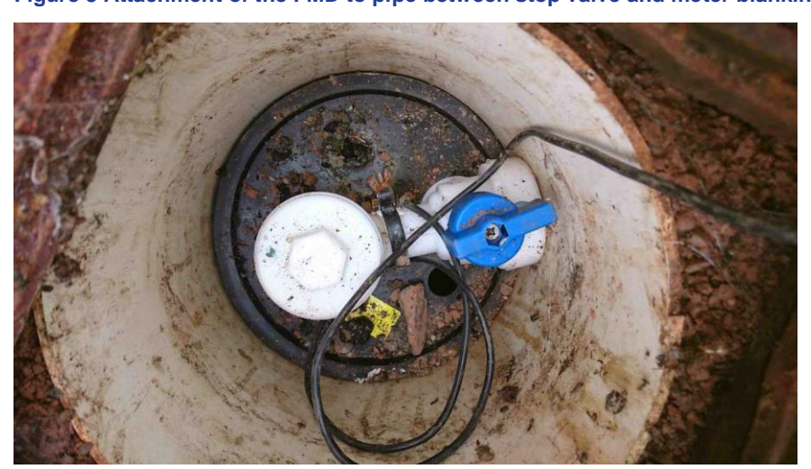
Figure 3 Attachment of the FMD to pipe between stop valve and meter blanking plate

It is likely that the FMD would be installed on the stop valve or service pipe in the footpath outside of a Customer's Property as indicated in Figure 2. Figure 3 shows a FMD installed.