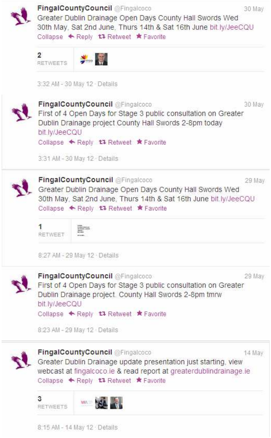
Figure 2.1 ASA Phase 2 Consultation Tweets

Fingal County Council has a popular Twitter page with over 3,000 followers and this account has been used to promote the consultation on Greater Dublin Drainage. Five "tweets" were issued by the Fingal Twitter account to promote the ASA Phase 2 Consultation. The tweets can be seen in Figure 2.1.