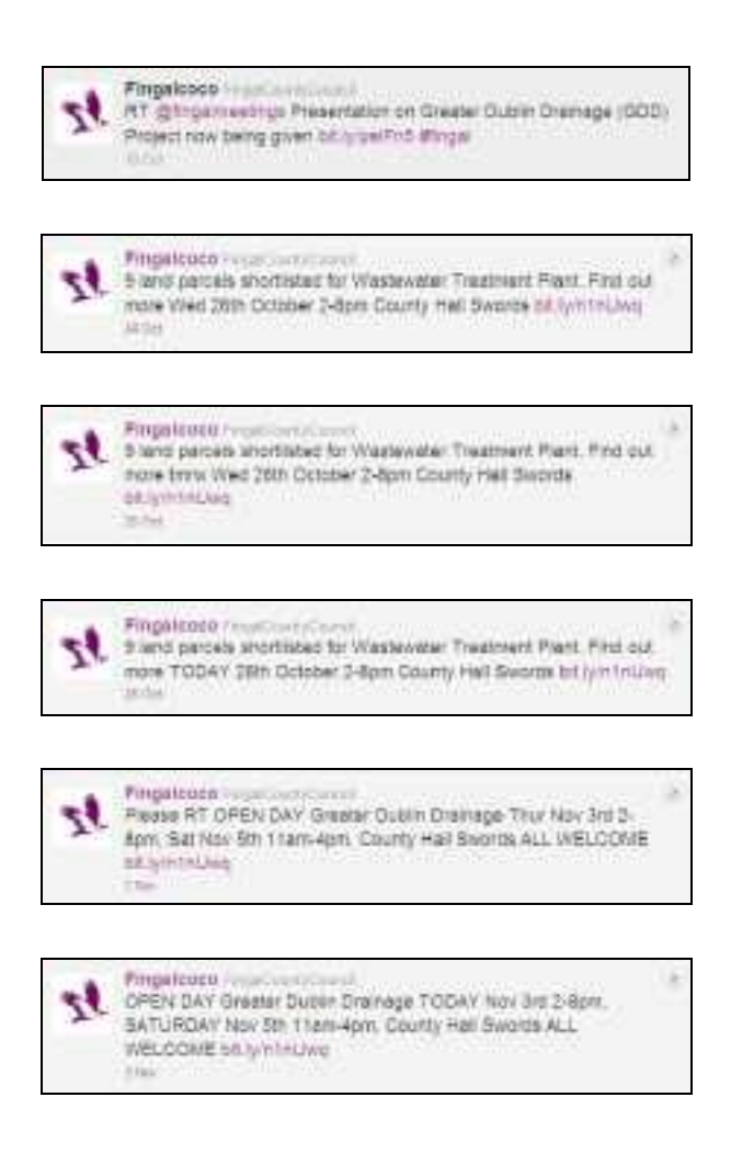
Figure 2.1: ASA Phase 1 Consultation Tweets