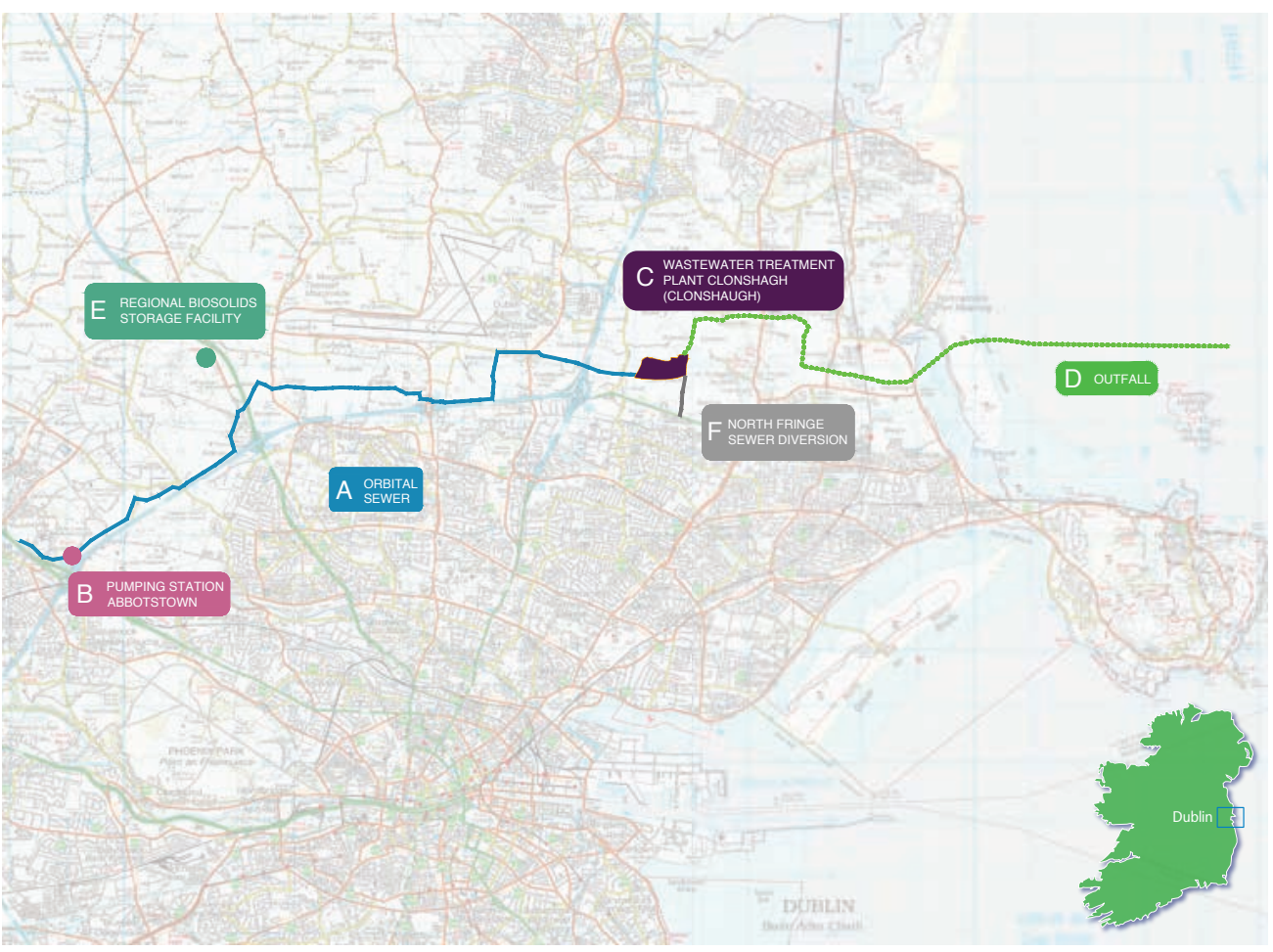
Greater Dublin Drainage Project Solution