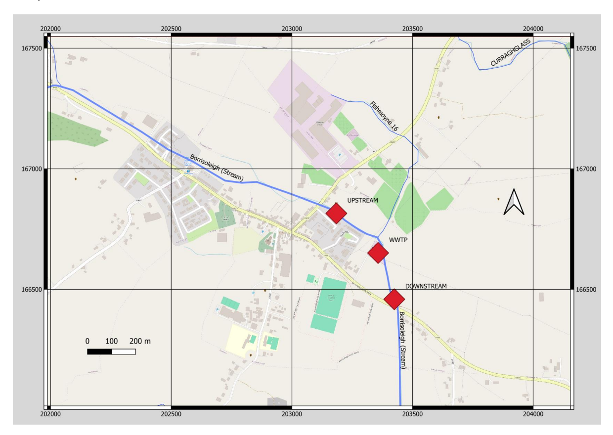
Figure 1. Location of upstream and downstream monitoring sites for Borrisoleigh WWTP. The river flows South.

Figure 1 maps the sampling sites and Table 2 gives the details of the locations sampled.