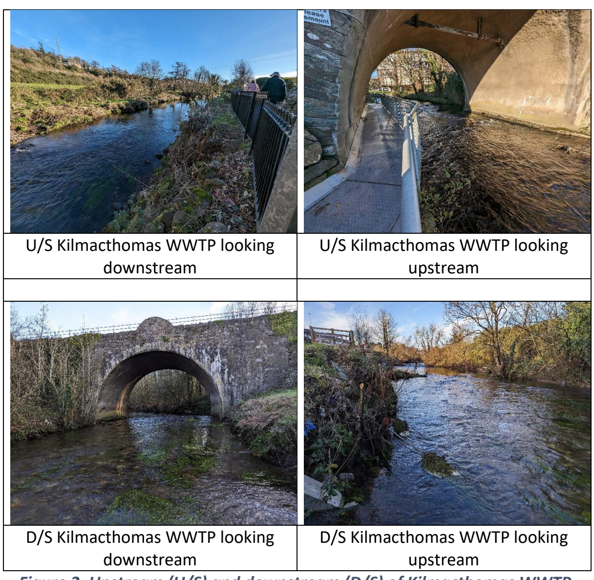
Figure 2. Upstream (U/S) and downstream (D/S) of Kilmacthomas WWTP.

Figure 2 shows photographs taken when sampling at Site 1 and Site 2 upstream and downstream of the Kilmacthomas WWTP on 5 December 2023.