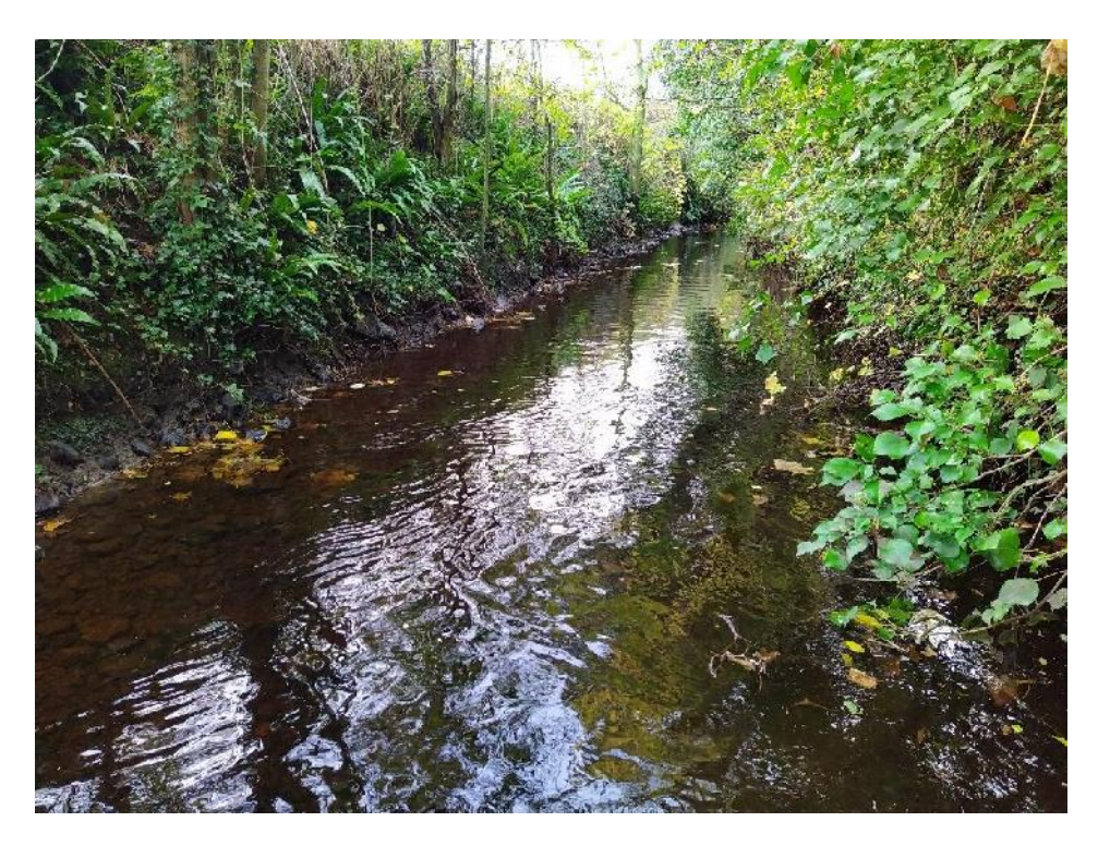
Coill Dubh upstream