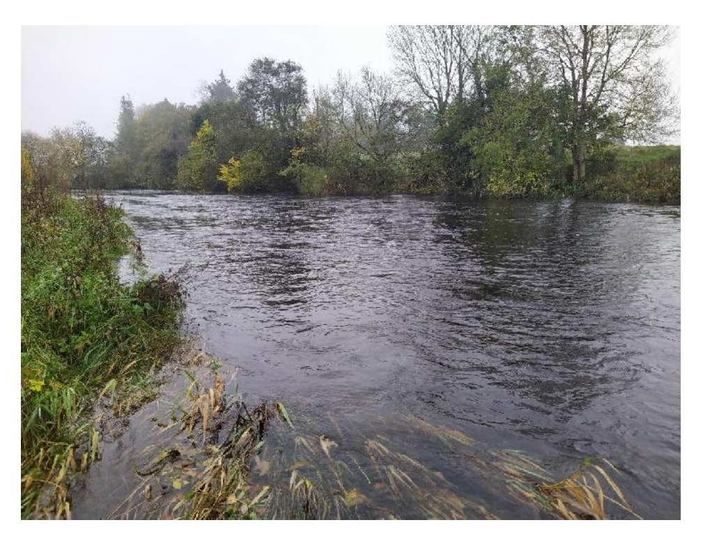
Ballymore Eustace upstream