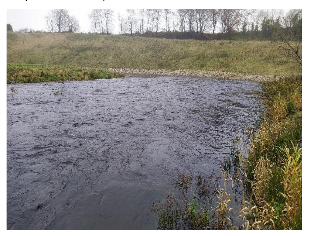
Ballymore Eustace downstream