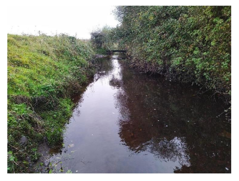
Coill Dubh Downstream