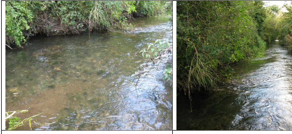
Plate 1: Castledermot WWTP - upstream SSRS site (14/10/20)