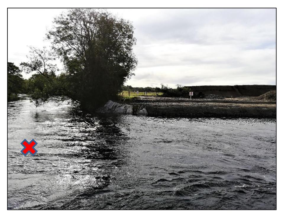
Plate 2: Construction works on opposite bank – channel reprofiling, geotextile bank revetment, construction related spoil upstream of discharge point - X marks approximate position of usual sampling location.