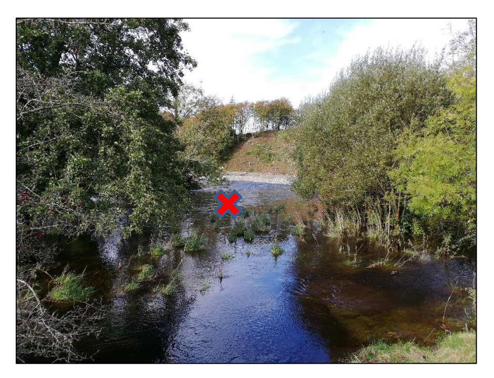
Plate 2: Excessively high river levels as a result of river diversion works and pulsed release of water from Pollaphuca Reservoir upstream (8am and 6pm each day) - X marks approximate position of usual sampling location. At this point the river was extremely swift and would be about 2m depth, or more.