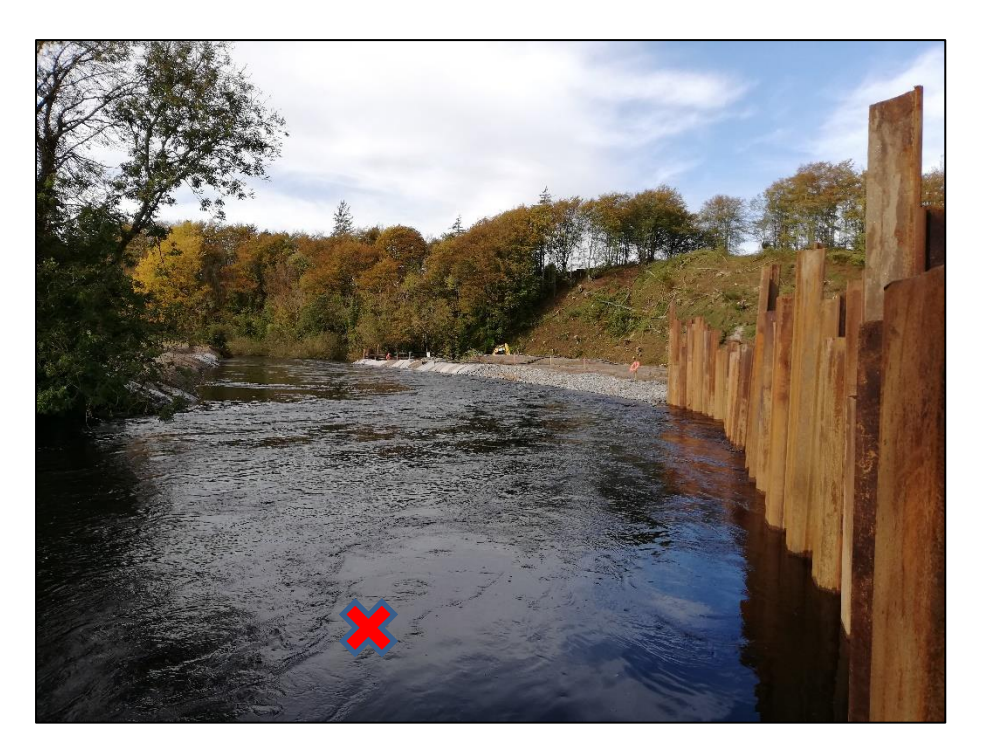
Plate 1: Significant instream construction works at the downstream SSRS site: sheet piling, channel reconstruction/diversion - X marks approximate position of usual sampling location.